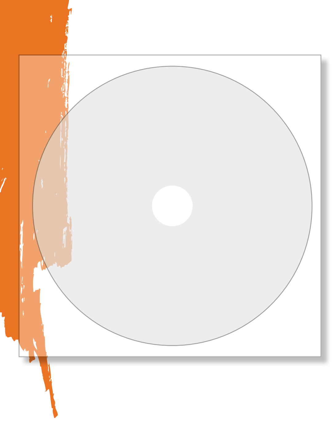
On this DVD we have brought together the accounts of major participants in the process of Basque standardization who describe the motivations, obstacles and triumphs in this fascinating story.