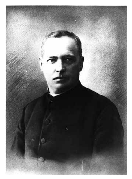
Resurreccion Maria Azkue

These intellectuals had forgotten that centuries earlier Spanish and French stood in precisely the same situation vis-à-vis Latin. In the sixteenth century, writers in these languages, as in the case of the languages then emerging elsewhere in Europe, still felt they needed to defend their language; Latin was still considered the language of culture par excellence. In the case of languages descended from Latin itself, the changeover was not so difficult, but in that of other languages, such as Basque, things were more complicated. Given that their language did not attain to the status of a language of culture, the Basque-speaking community was branded illiterate or even plain ignorant despite a rich cultural tradition which had mainly been transmitted orally. This dichotomy between cultured and uncultured peoples lasted many centuries - far too many!